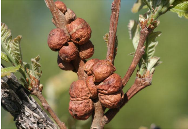
Figure 3, 4. (Above) Twiggalls produced by the rough bulletgall wasp. (Below) Twiggalls in various stages of development during late summer. (There is an acorn in the lower center.)