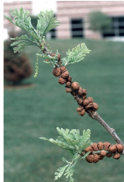
Figure 1. Galls produced by the rough bulletgall wasp on bur oak

A female only (agamic) generation of adult wasps emerge from the large twig galls in late October and early November. A small, circular exit hole in the gall is produced during emergence. Shortly after emergence the females insert eggs into the terminal growth of the dormant buds.