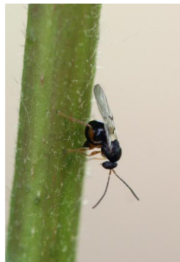
Figure 6. Spring form female of the rough bulletgall wasp ovipositing in current season twig.

This insect can cause some injury to susceptible trees. Very heavy infestations can